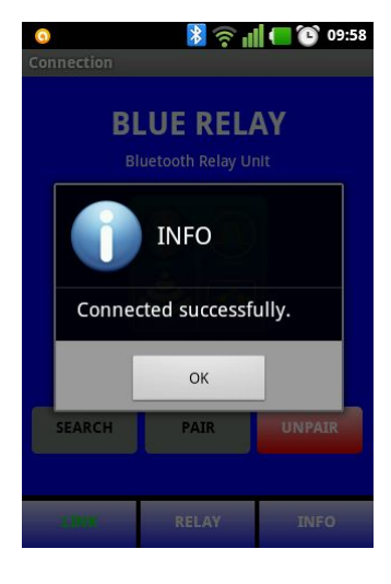
Fig.2 - Screenshots of the LINK page (start page).