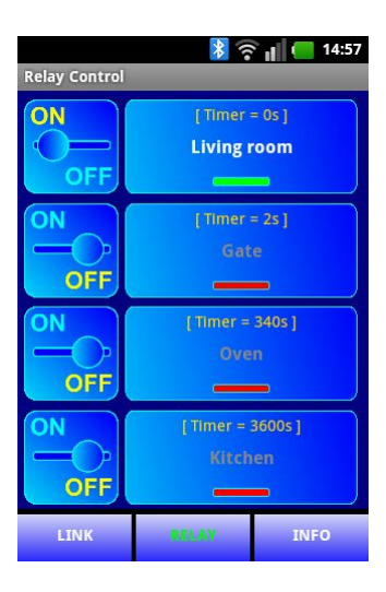
Fig.5 - Screenshots of the RELAY page. Edit Label associated with a relay.

To set the relay in monostable or bistable mode, you should always select the description field on the right: "Relay Description". On the dialog " SELECTION" (Fig. 4) select "Timer". On the window that appears (Fig. 6) you can specify a time between 0 and 6550 seconds. If the time is set to 0, then the relay will be without timer and its operation will be Bistable, that is once you have selected the ON / OFF state, it will remain in that state indefinitely until it is changed by the operator. Conversely, if you will specify a time period between 1 and 6550 seconds, then the relay will be configured in monostable mode. In monostable mode the relay remains in the ON state for a time period equal to that specified, and then automatically return to OFF when the timer expires.