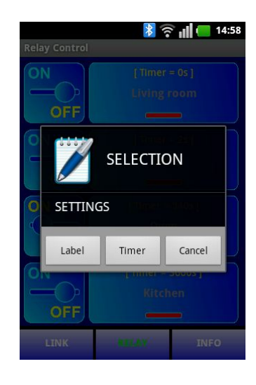
Fig.4 - Screenshots of the RELAY page.