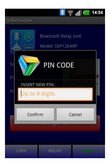
Fig.3 - Screenshots of the INFO page.

On the RELAY page, the user can set the status of each of the four relays, modify their label, and define the mode of operation of each of them (monostable or bistable mode).